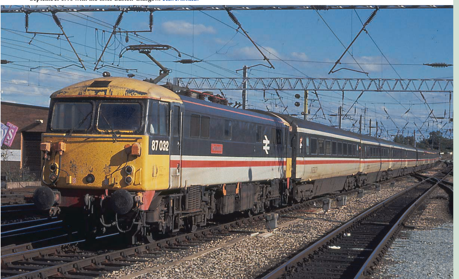
BELOW: Following the BR Blue colour scheme, most of the class gained the InterCity colour scheme. Here No. 87032 arrives at Carlisle on 18th September 1990 with the 13.15 Euston-Glasgow.

The class settled down to regular passenger work and during the 1980s even featured (in pairs) on freight traffic, being used to haul the heavy steel trains over Shap from Ravenscraig to Warrington where diesel power took over for the