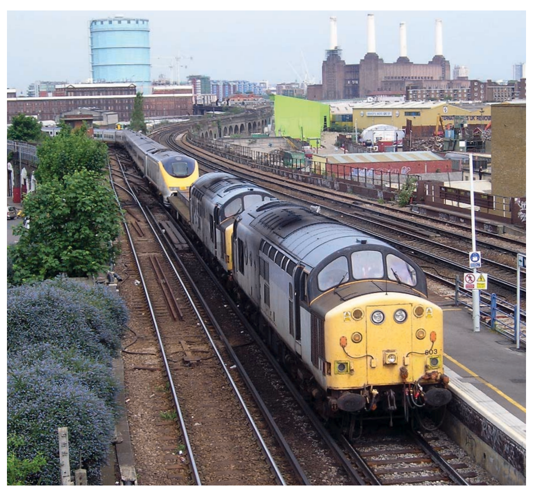
ABOVE: EPS Class 37/6 Nos. 37603 and 37604 drag 'Entante Cordiale' liveried Eurostar, Nos. 373313 and 373314 through Wandsworth Road on 26th May, bound for Dollands Moor. Jon Bradley

The first Summer Saturday of 2005 got off to a good start (see seperate story) when GNER 'buffered' power car No. 43080 lead a rake of Midland Mainline stock and No. 43070 from Leeds Neville Hill to Manchester Piccadilly.