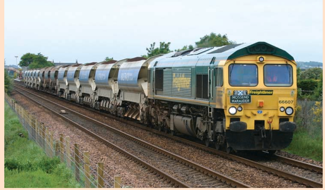
ABOVE: Freightliner Heavy Haul ran its first ballast north of Central Scotland at the end of May and beginning of June. Previously the only Freightliner Heavy Haul traffic to Inverness has been cement services from Oxwellmains. The first train operated on 31st May, powered by Class 66/6 No. 66622 from Millerhill to Inverness, via the Highland Main Line, with ballast for the Keith area. The train returned as 6Y40 05.10 Huntly to Millerhill on 2nd June. The second service ran on 5th June as 6B72 11.45 Millerhill-Tomatin, via Perth, Aberdeen and Inverness, with motive power supplied by Class 66/6 No. 66607. The second train is pictured need Barry Links on 5th June.