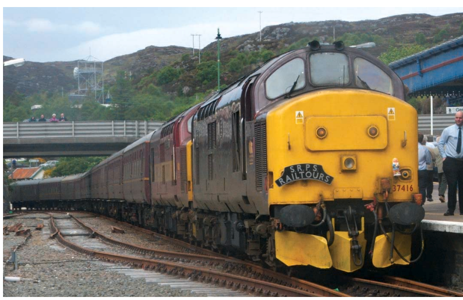
ABOVE: On the 28th May, EWS Class 37/4 Nos. 37416 and 37417 headed and SRPS tour to Kyle of Lochalsh, where the two Type 3s are seen shortly after arrival. The next SRPS charter to Mallaig on 11th June saw what is scheduled to be the last use of EWS Class 37/4s on SRPS trains. Jamie McEwan

at the helm. In Anglia, Class 66 No. 66089 was employed to move the Hitachi V Train from Ilford to Shoeburyness, whilst the same afternoon, Class 90 No. 90007 failed on the 17.00 London Liverpool Street - Norwich service and was rescued by Class 47/8 No. 47818. On the Great Western Main Line, Class 47/0 No. 47150 hauled unit Nos. 1831, 1858 and 1865 from Stewarts Lane to Caerwent (5Z45).