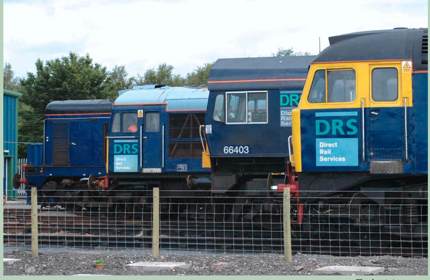
A Railway Herald News Special Direct Rail Services, Carlisle Kingmoor Open Day