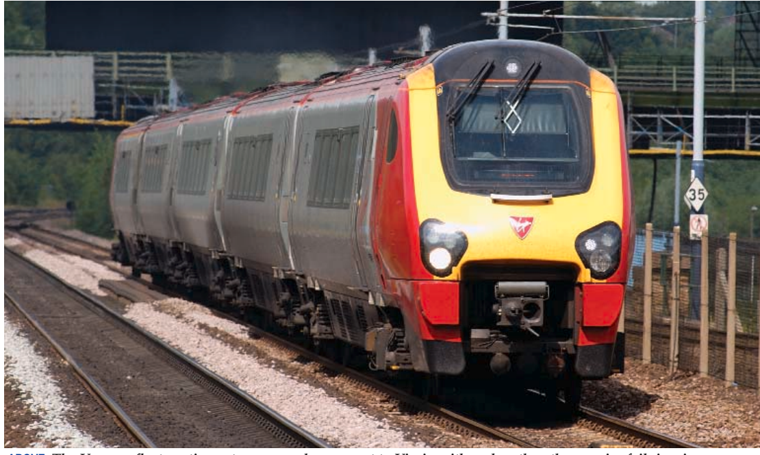
ABOVE: The Voyager fleet continues to cause embarrasment to Virgin with no less than three major failuires in one week. No. 221129 approaches Meadowhall on 9th June.

Virgin pressed one of the Summer Saturday HST sets into traffic to work 07.20 departure from Plymouth as far as Birmingham New Street, from where it returned to Plymouth as the 12.13 departure, before heading ECS to Plymouth Laira depot. Also in use was the EWS Class 90 diagra between Manchester Piccadilly and Birmingham New Street