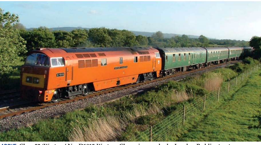
ABOVE: Class 52 'Western' No. D1015 Western Champion worked a London Paddington to Kingswear charter on 28th May. Here No. D1015 storms northwards near Worle Junction with the return working in beautiful summer evening sunshine.

The Arriva Trains liveried Class 150 No. 150284 continous to warrent attention,