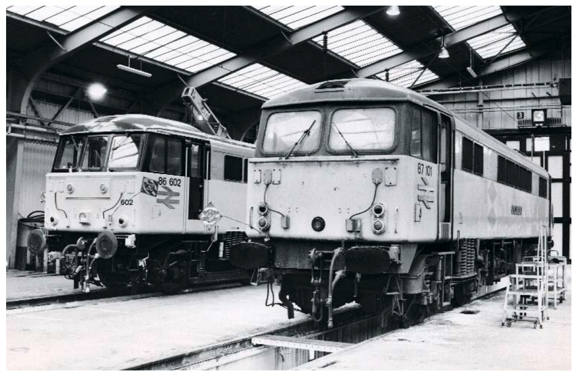
ABOVE: In more recent times, the sole Thyrister controlled Class 87/1 No. 87101 Stephenson was part of the Railfreight Distribution sector. The locomotive is pictured at Crewe Depot on 14th September 1995, in the company of Class 86/6 No. 86602.

classified as Class 87/0s, with the final member of the class becoming No. 87101. The latter loco was developed as part of a project to test an advance traction control system, called Thyrister control. The whole project was funded by GEC Traction and the locomotive itself could be driven as a normal Class