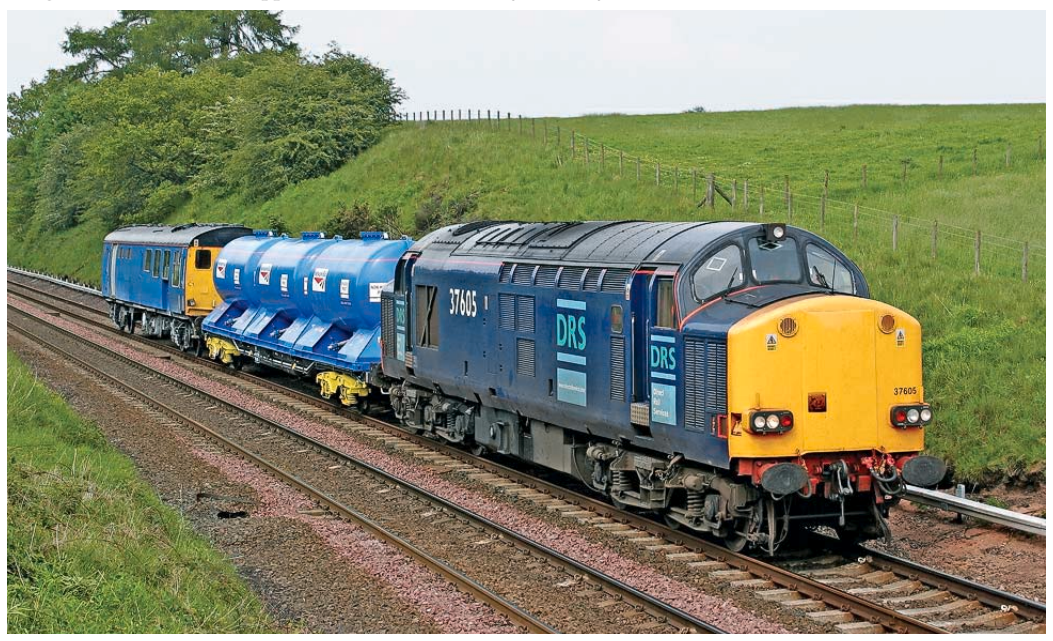
BELOW: On the 8th June, DRS Class 37/6 No. 37605 operated a weedkilling service from York NRM to Carlisle Kingmoor. Here the train approaches Carlisle on the Tyne Valley line.

Bank Holiday Monday, 30th May found FM Rail green liveried Class 47 No. 47832 working an Acton Bridge -Minehead charter whilst Newport and South Wales continued its Loco-Hauled gala weekend, with Nos. 67022 and 67030 worked 1Z67 08.15 Stratford (East London) to Cardiff and the Fifty Fund's Class 50s Nos. 50031 and 50049 worked 1Z59 09.15 Stratford -Cardiff. On the Marches route, No. 67012 was provided for 1Z63 08.24 Preston - Cardiff service, whilst 47847 and 47853