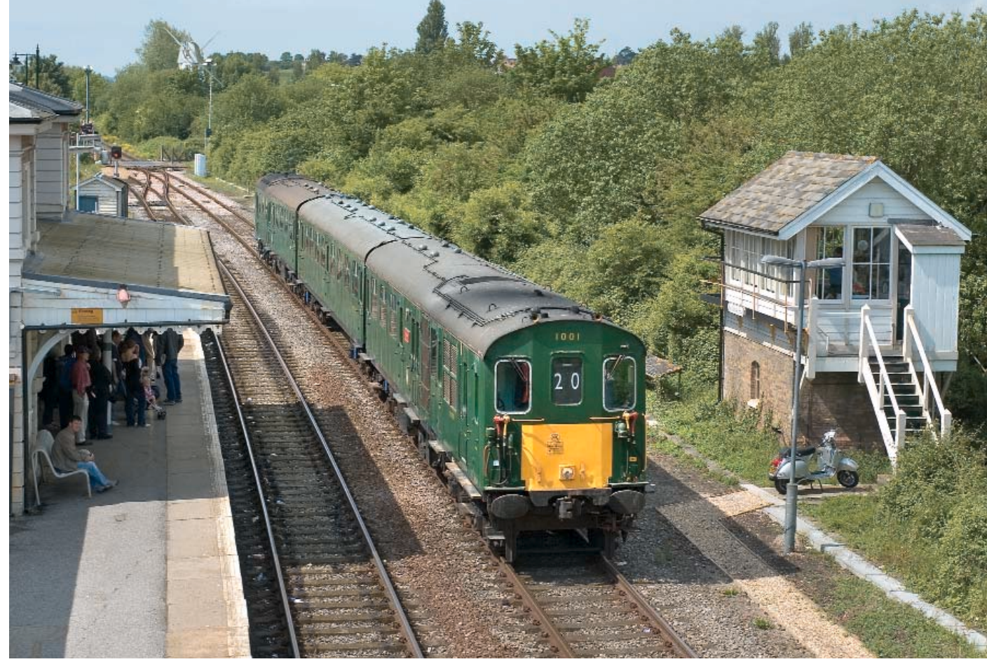
ABOVE: Owned and operated by Hastings Diesels Ltd, No. 1001 has been regularly employed by Southern on the Hastings-Ashford service. Here the unit arrives at Rye on 31st May with the 10.24 Hastings-Ashford International service.