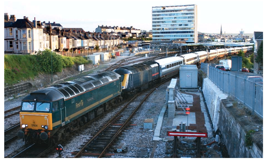
ABOVE: Class 57/6 No. 57604 Pendennis Castle rescues the failed HST and is pictured at Plymouth on 28 May, heading for Laira depot.

The days proceedings were running well up to the afternoon when Nos. 43080 and 43070 failed at Lostwithiel on the 1M28 15.22 Newquay - Manchester service. This caused