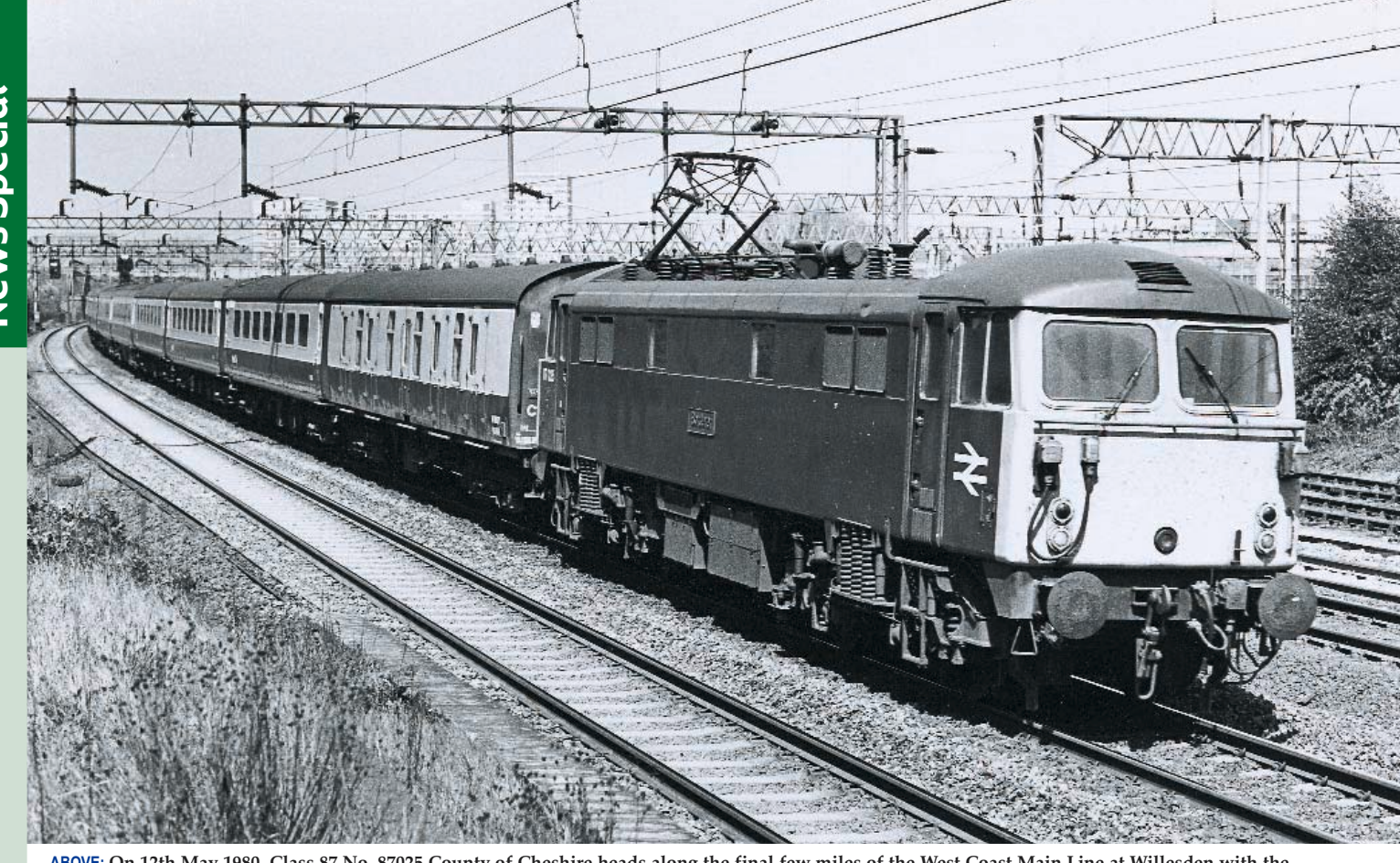
ABOVE: On 12th May 1980, Class 87 No. 87025 County of Cheshire heads along the final few miles of the West Coast Main Line at Willesden with the 06.00 Carlisle-Euston service. The photograph shows the original crossarm pantograph design which provided a maximum speed of 90mph and later 100mph.