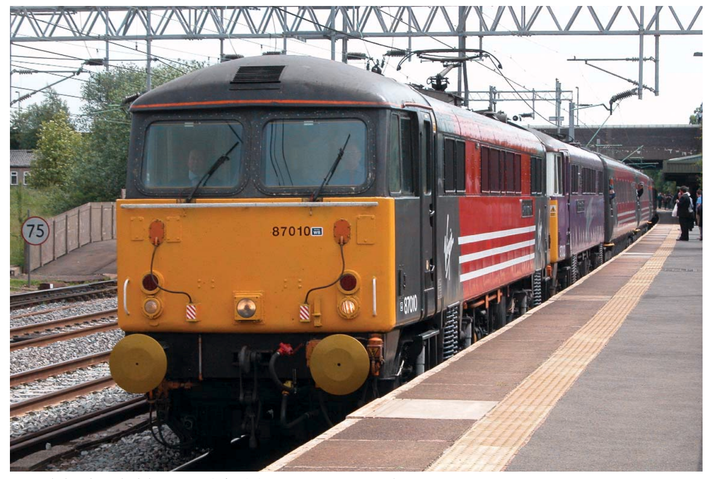
ABOVE: The last Class 87 hauled passenger train for Virgin West Coast, 1H80 09.38 London Euston - Manchester Piccadilly calls at Tamworth Low Level on 10th June, with 87010 at the helm. 87002 was dragged dead to Stockport, from where the pair powered the final few miles to Manchester.

BELOW: The following day, both Class 87s returned to Willesden Depot in North London. Having run ECS with the Mark 3 stock from the previous days train, the pair were then detached and ran light engine to London. 87002 leads 87010 through Coventry on 11th June, on the very final Class 87 working for Virgin Trains on the West Coast Main Line.