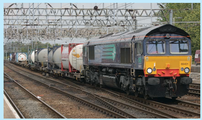
ABOVE: Is it flows like this, that are the key to transfering freight from road to rail? Direct Rail Services Class 66/4 No. 66401 heads south through Crewe on 27th May with a reasonably well loaded Widnes - Purfleet intermodal service. The flow has recently been provided with Company Neutral Revenue Support (CNRS) by the Strategic Rail Autority (see seperate story) which provides revenue support to the rail operator.