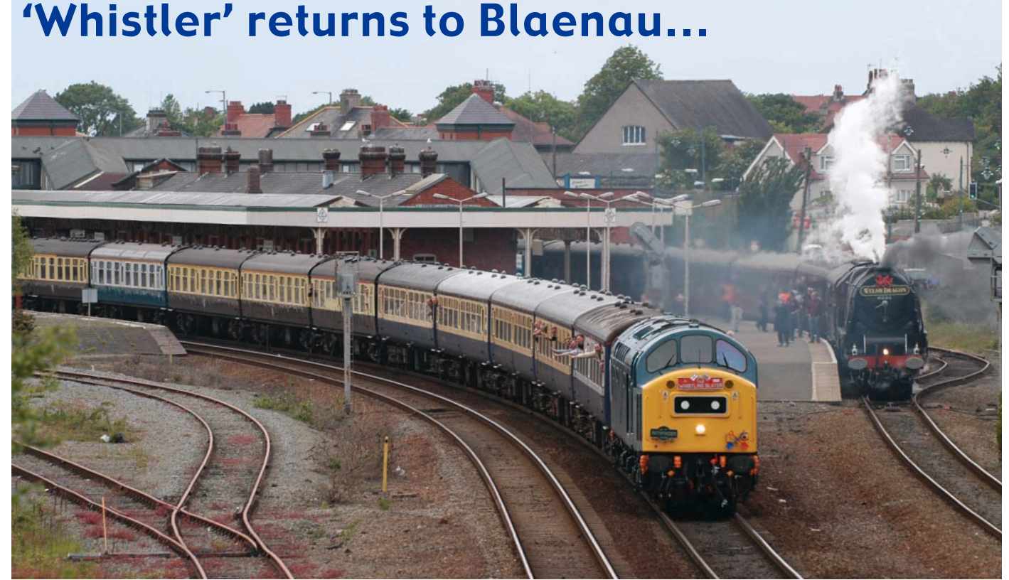
ABOVE: The Class 40 Preservation Society's Class 40 No. 40145 passes non-stop through Llandudno Junction on 5th June, destined for Bristol Temple Meads. The train had earlier visited Blaenau Ffestiniog and Holyhead. Along side, LMS Pacific No. 6233 Duchess of Sutherland awaits the road to Crewe, with a return charter from Holyhead.

The extraordinary sight of a First Great Western Green liveried Class 57 on an ex-GNER power car on the top of a rake of Midland Mainline RIO stock departed Lostwithiel at 1935. The train continued to Laira Depot and was noted passing Plymouth station at 2040 rather than its booked departure time of 1706!