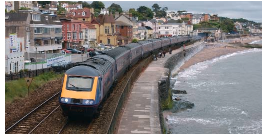
ABOVE: Recently released from Brush Traction at Loughborough, Class 43 No. 43009 has been re-engined as part of Angel Train's HST life extension programme. The power car, together with 43004, has been fitted with an MTU 16V4000 engine as part of a project jointly funded by Angel Trains and First. On one of its first loaded test runs, No. 43009 with 43022 on the rear passes Dawlish on 2nd June, bound for Plymouth. RICHARD TUPLIN