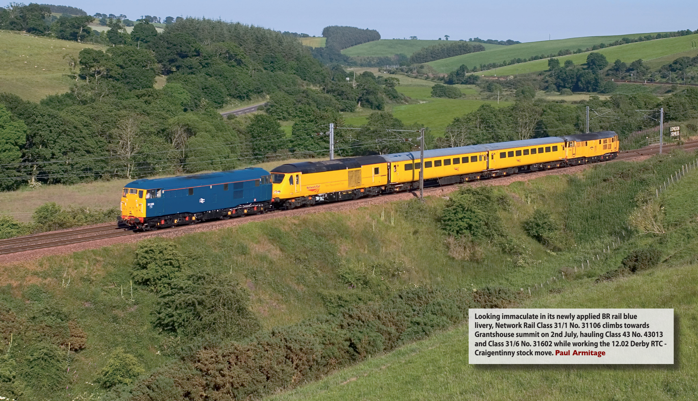
Looking immaculate in its newly applied BR rail blue livery, Network Rail Class 31/1 No. 31106 climbs towards Grantshouse summit on 2nd July, hauling Class 43 No. 43013 and Class 31/6 No. 31602 while working the 12.02 Derby RTC - Craigentenny stock move. Paul Armitage