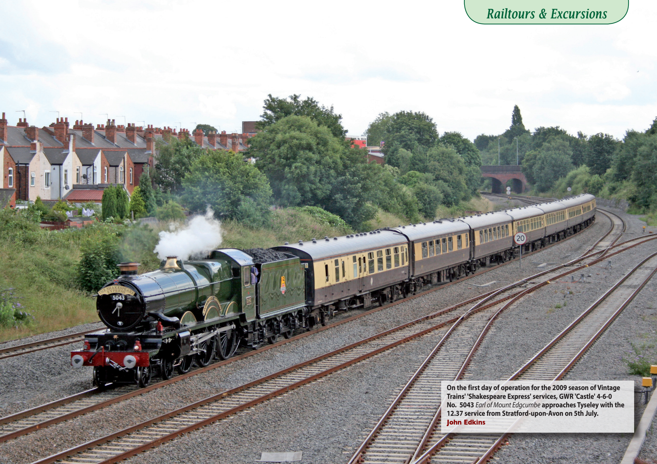
On the first day of operation for the 2009 season of Vintage Trains' 'Shakespeare Express' services, GWR 'Castle' 4-6-0 No. 5043 Earl of Mount Edgcumbe approaches Tyseley with the 12.37 service from Stratford-upon-Avon on 5th July.