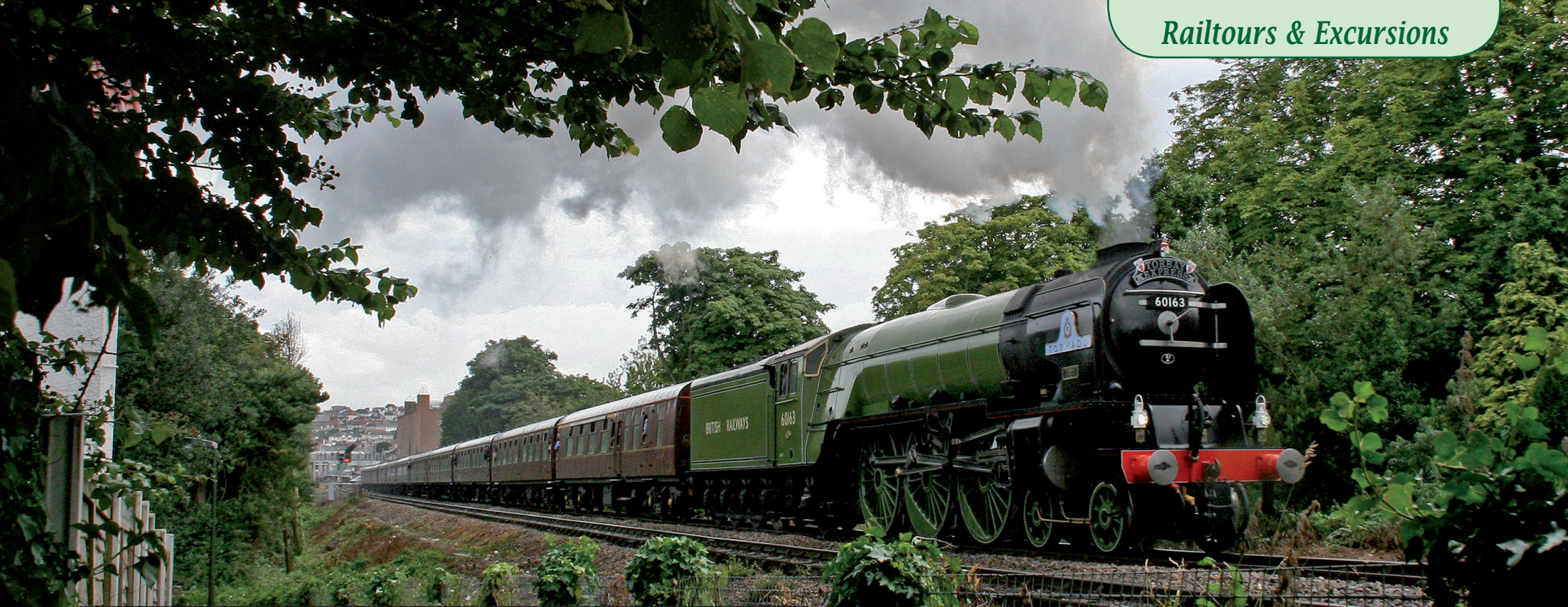
▲ LNER A1 Pacific No. 60163 Tornado visited Devon on 5th July, seen departing Paignton for Bristol Temple Meads with the inaugural 'Torbay Express' of the season.