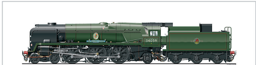
Sir Archibald Sinclair Illustrated by Richard Green

Severn Valley Railway Battle of Britain Locomotive Group receives £5 from each print Scale: 8mm/ft (Print size 690mm x 305mm) • 450 signed & numbered • £28 (free p&p) Further details: www.locos-in-profile.co.uk