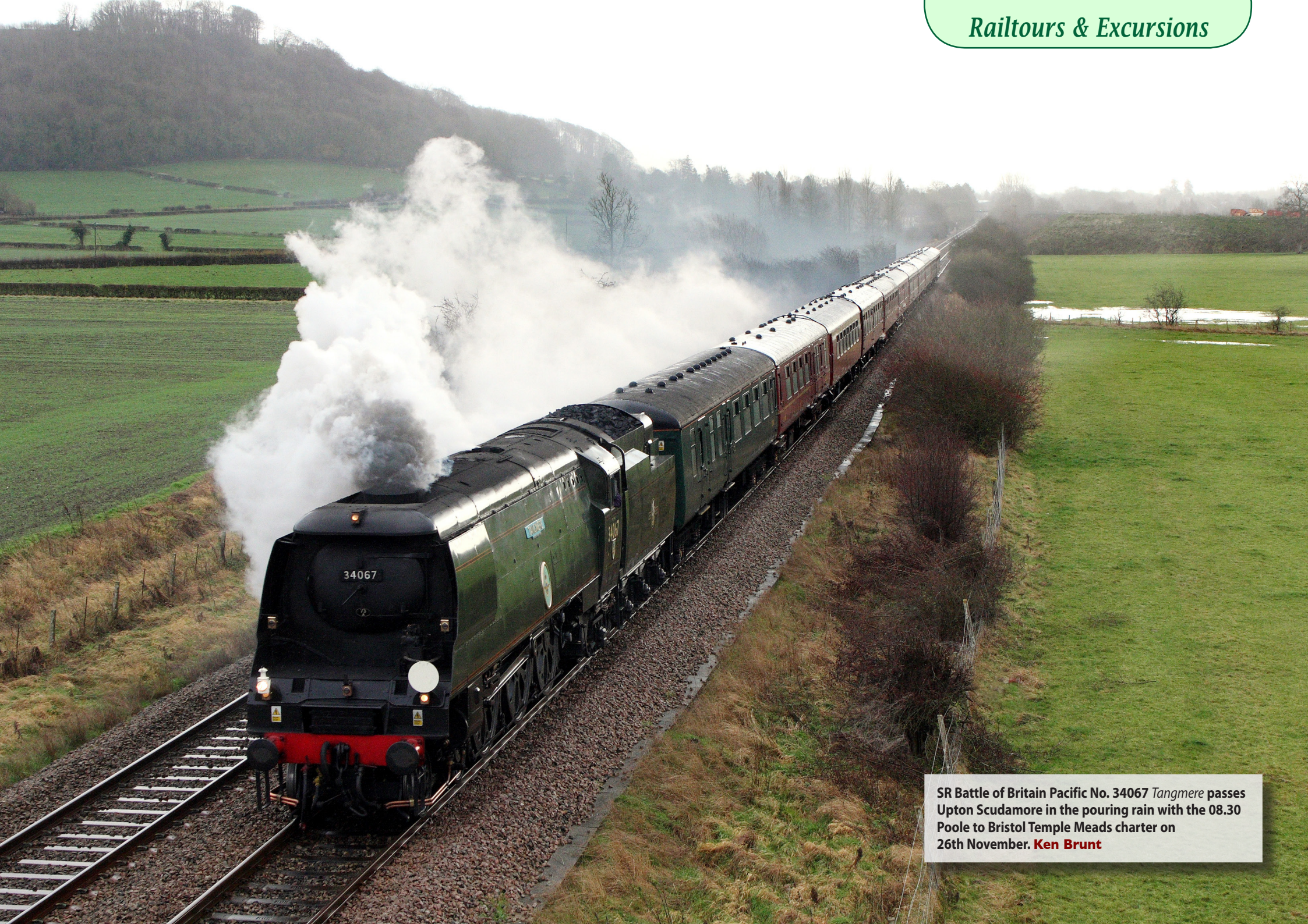
SR Battle of Britain Pacific No. 34067 Tangmere passes Upton Scudamore in the pouring rain with the 08.30 Poole to Bristol Temple Meads charter on 26th November.