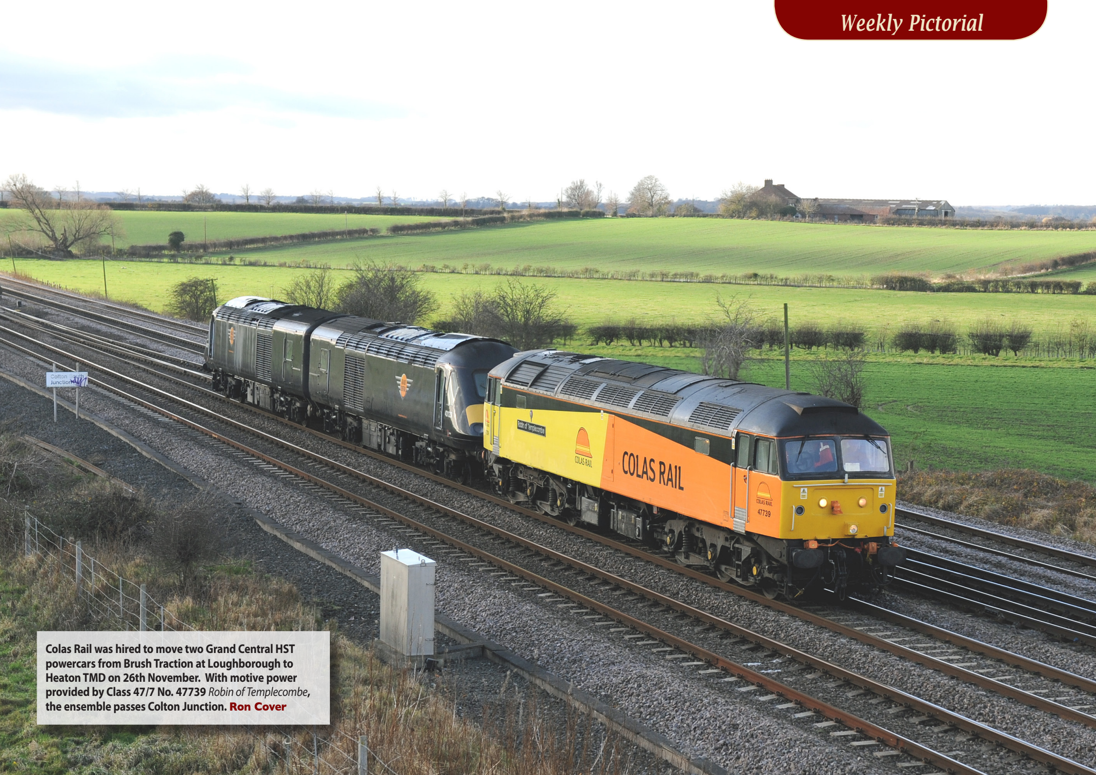
Colas Rail was hired to move two Grand Central HST powercars from Brush Traction at Loughborough to Heaton TMD on 26th November. With motive power provided by Class 47/7 No. 47739 Robin of Templecombe , the ensemble passes Colton Junction. Ron Cover