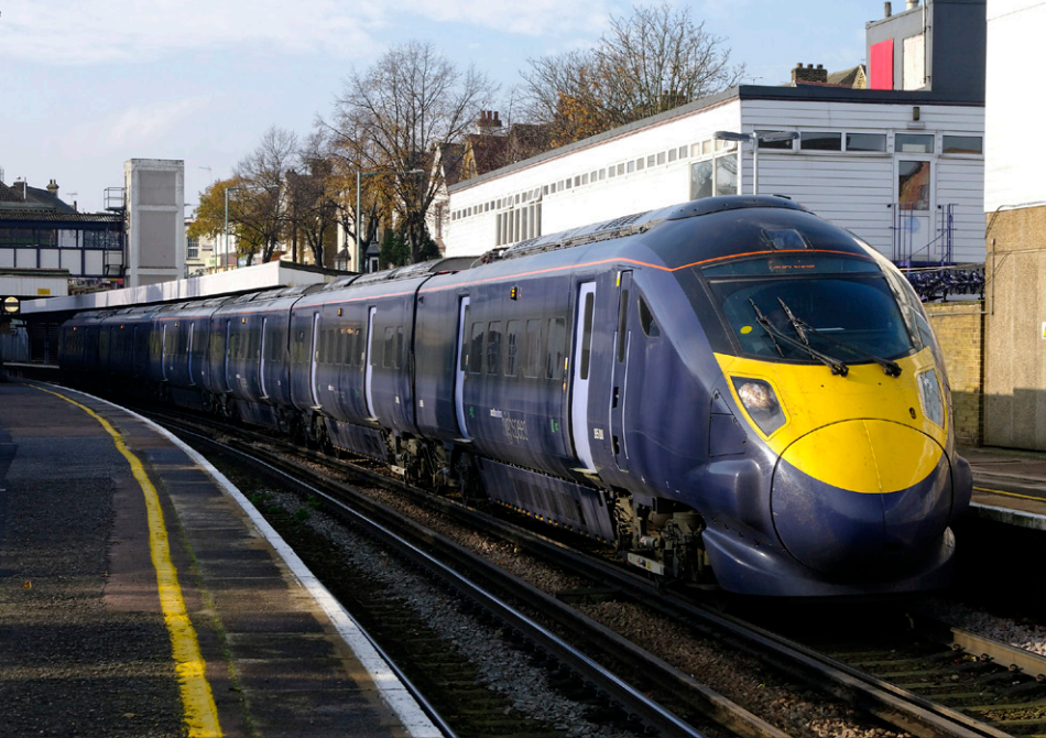
▲ Class 395 No. 395008 stands at Gillingham while working the 10.53 St Pancras to Faversham service, as part of the high-speed preview commuter operation on 20th November. Jonathan Makepeace