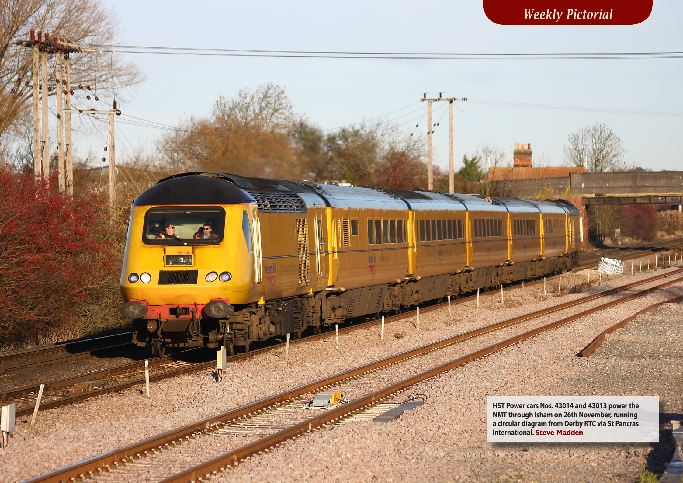
HST Power cars Nos. 43014 and 43013 power the NMT through Isham on 26th November, running a circular diagram from Derby RTC via St Pancras International. Steve Madden