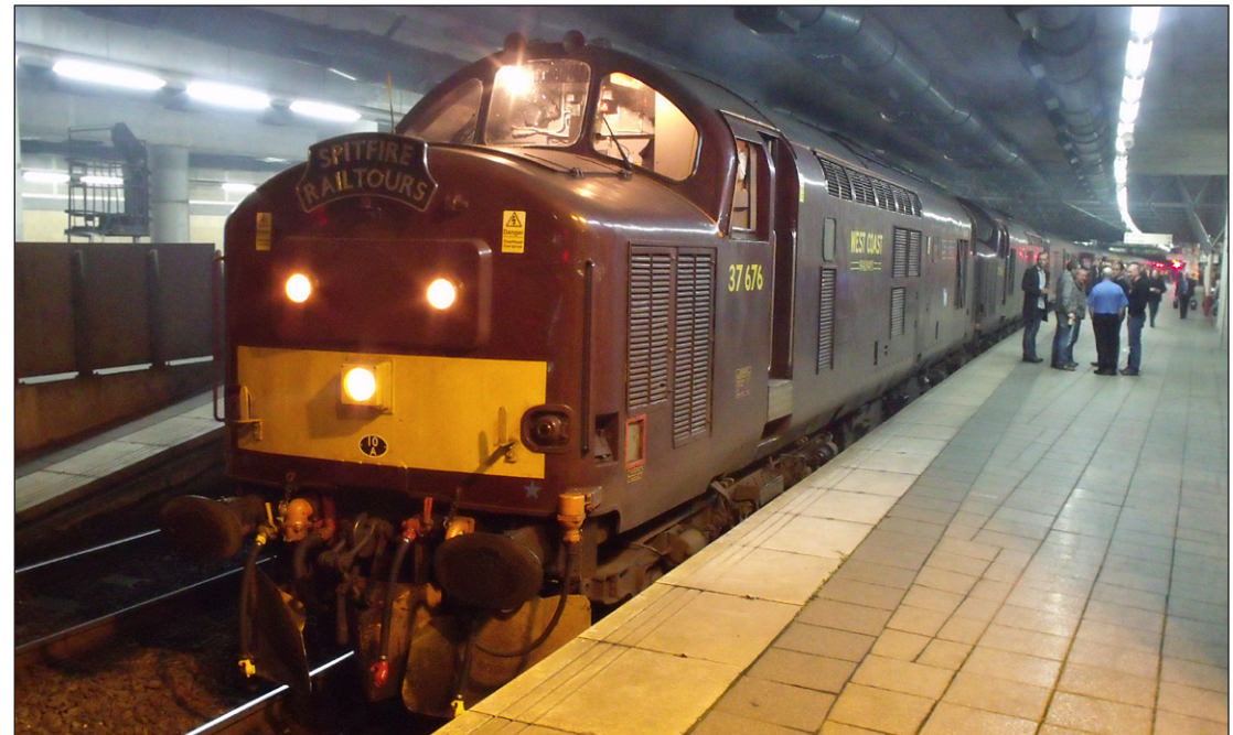
▼ WCRC Class 37/5s Nos. 37676 & 37516 are seen at Manchester Victoria while working Spitfire Railtours 'Lowland Growler' charter from Edinburgh to Preston.