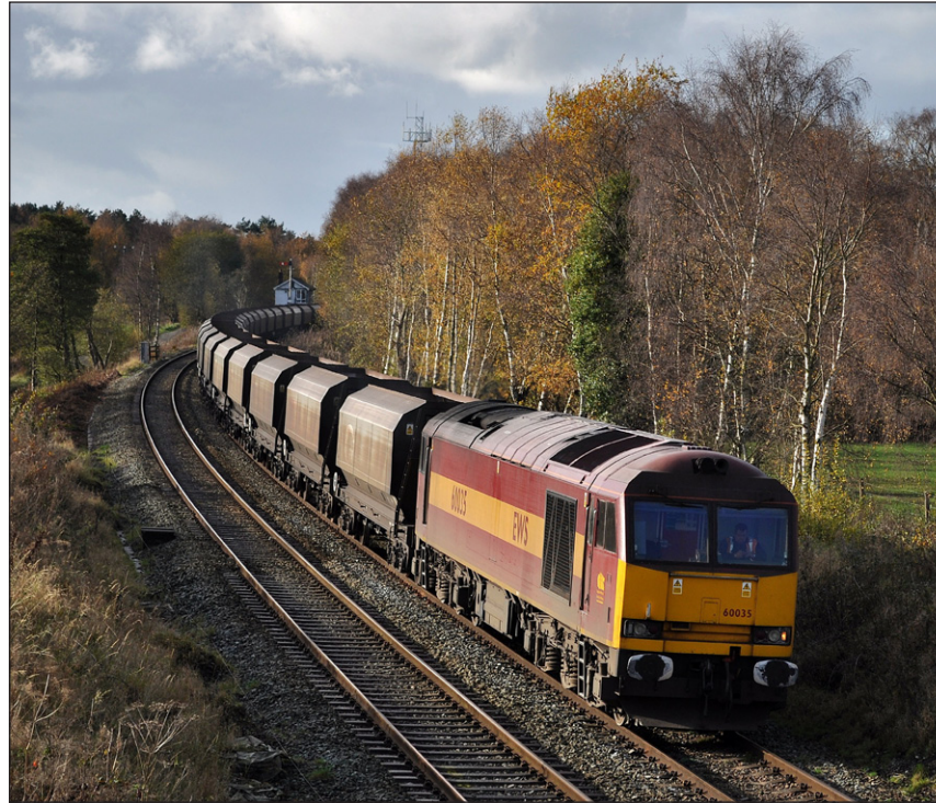
▲ Class 60 No. 60035 passes Plumley Signal Box on a late running Oakeigh-Tunstead working with empty stone wagons on 17th November. Anthony Roberts

Transport Secretary, Lord Adonis, said: "Oyster on rail will open up a range of new journey opportunities for Londoners, but we must not stop there — I want to see smart ticketing on all modes of public transport in England as quickly as possible". Train operators will be able to set their own prices for journeys.