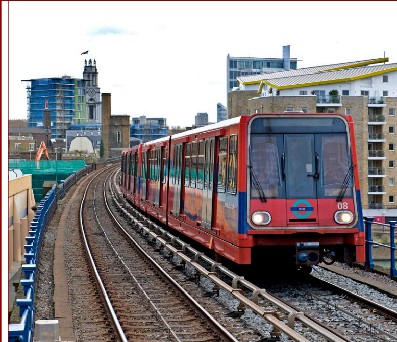
▲ DLR B2K class B-2-B unit No. 08 approaches Limehouse on 27th November, leading a service from Lewisham to Tower Gateway.

The current freight container market is significantly growing in the percentage of 'high cube' containers, their use currently standing at over 40%. This is expected to rise to between 50% and 70% by 2019.