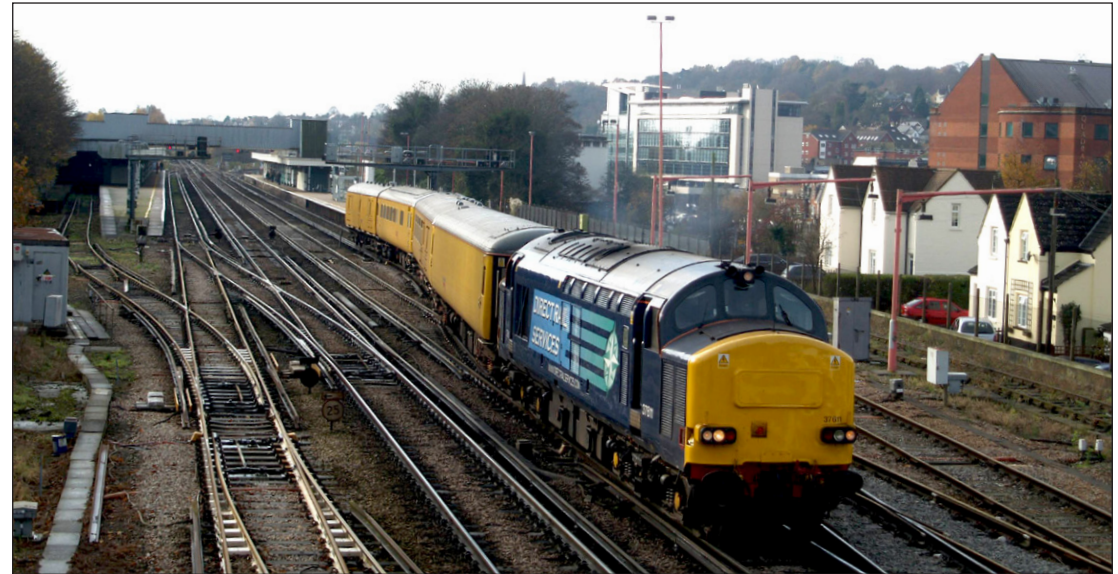
▲ DRS Class 37/6 No. 37611 passes Redhill on an Ultrasonic Test Train, working from Dollands Moor to Ferme Park on 21st November.

The afternoon Eastleigh to Wembley 'Enterprise' had motive power supplied by Class 66 No. 66089, with Class 58 No. 58006 in the consist, while also 'hitching a lift' were Class 37/4s Nos. 37401 and 37425, which returned to Warrington after the weekend Cambrian work behind Class 92 No. 92012 Thomas Hardy . Colas Rail's Class 47/7 No. 47739 Robin of Templecombe worked 'light engine' from Ashford to Doncaster in the afternoon, in preparation for a stock movement the following day, while 'hired-in' Hanson Traction Class 56/3