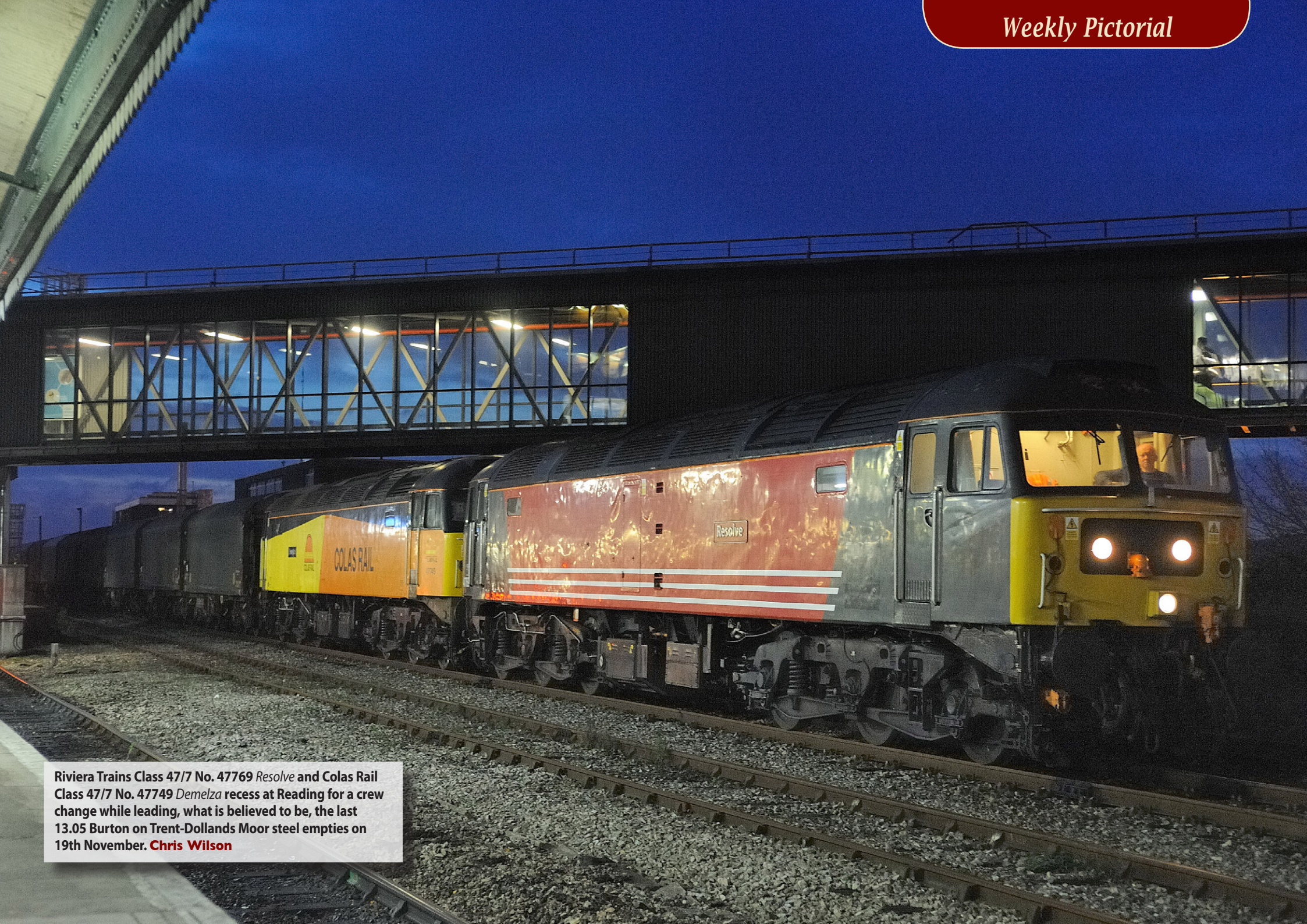
Riviera Trains Class 4777 No. 47769 Resolve and Colas Rail Class 4777 No. 47749 Demelza recess at Reading for a crew change while leading, what is believed to be, the last 13.05 Burton on Trent-Dollands Moor steel empties on 19th November.