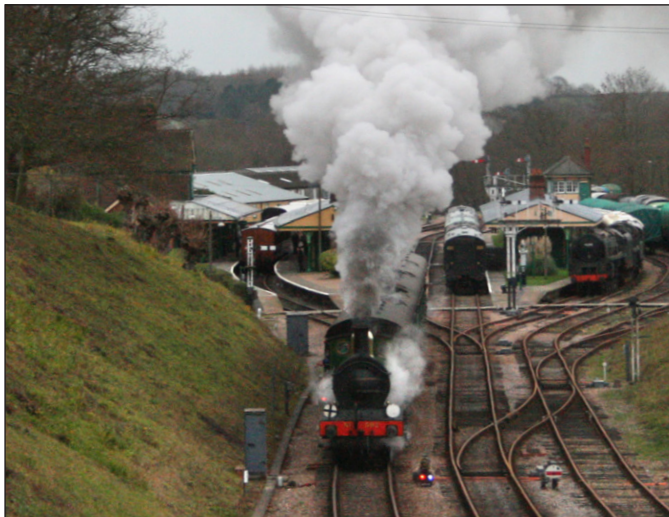
◀ South Eastern & Chatham Railway 'C' Class 0-6-0 No. 592, built in 1902, makes a volcanic departure from Horsted Keynes with the 15.00 service from Sheffield Park on 28th November.