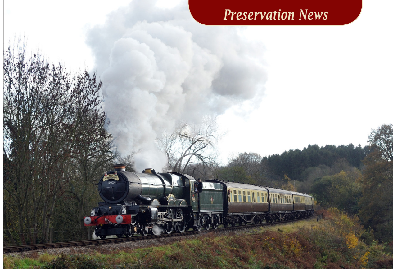
▲ GWR 'King' No. 6024 King Edward I approaches Hay Bridge as it accelerates away from a speed restriction on 15th November with the 12.00 Kidderminster to Bridgnorth 'Sunday Lunch' train. This was the only run that the loco undertook during its visit to the railway.

It is anticipated that with the number of times that the Victorian train operates, that the carriage will provide capacity for around 1,500 wheelchair passengers every year.