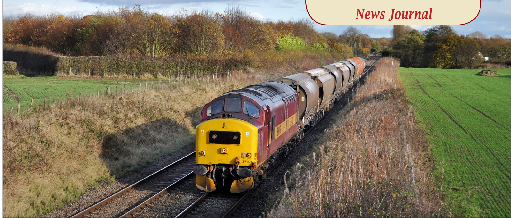
▲ Class 37/4 No. 37401 passes Plumley on 17th November with the Tuesdays-only Dowlow to Warrington 'trip'. Anthony Roberts

Network Rail engineers have worked around the clock to design and build a small, temporary loop around the section of track above the damaged arch on the adjacent land, which was once occupied by the Feltham marshalling yards. This will allow trains to cross the river safely while repairs to the permanent structure are carried out. The main arch of the bridge was damaged after prolonged and intense rainfall caused the river to swell. The increased speed and turbulence of the water washed away some of the foundations of the 100-year-old structure, causing part of brickwork to be dislodged.